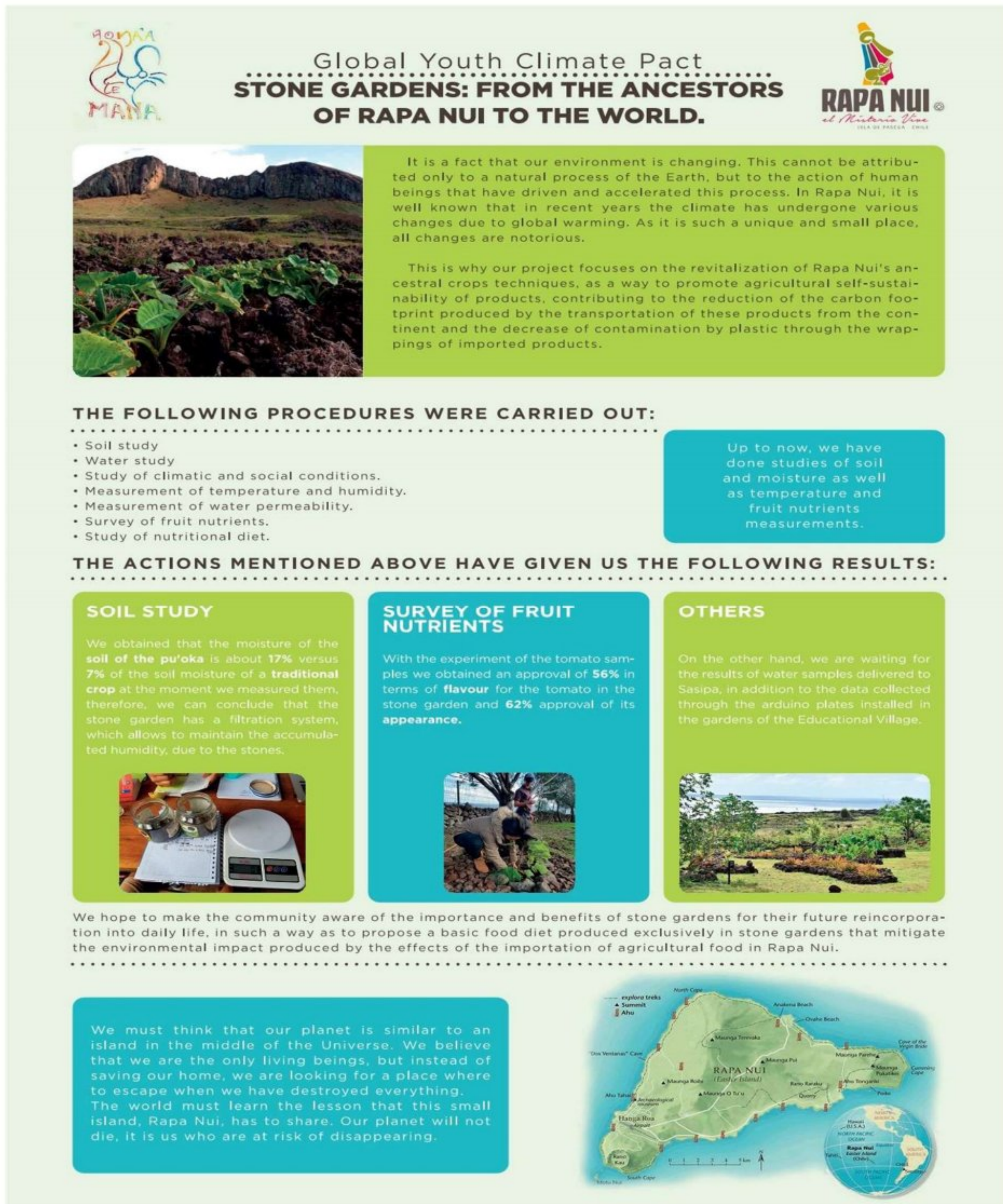
Figure A2. Stone gardens: from the ancestors of Rapa-Nui to the world.