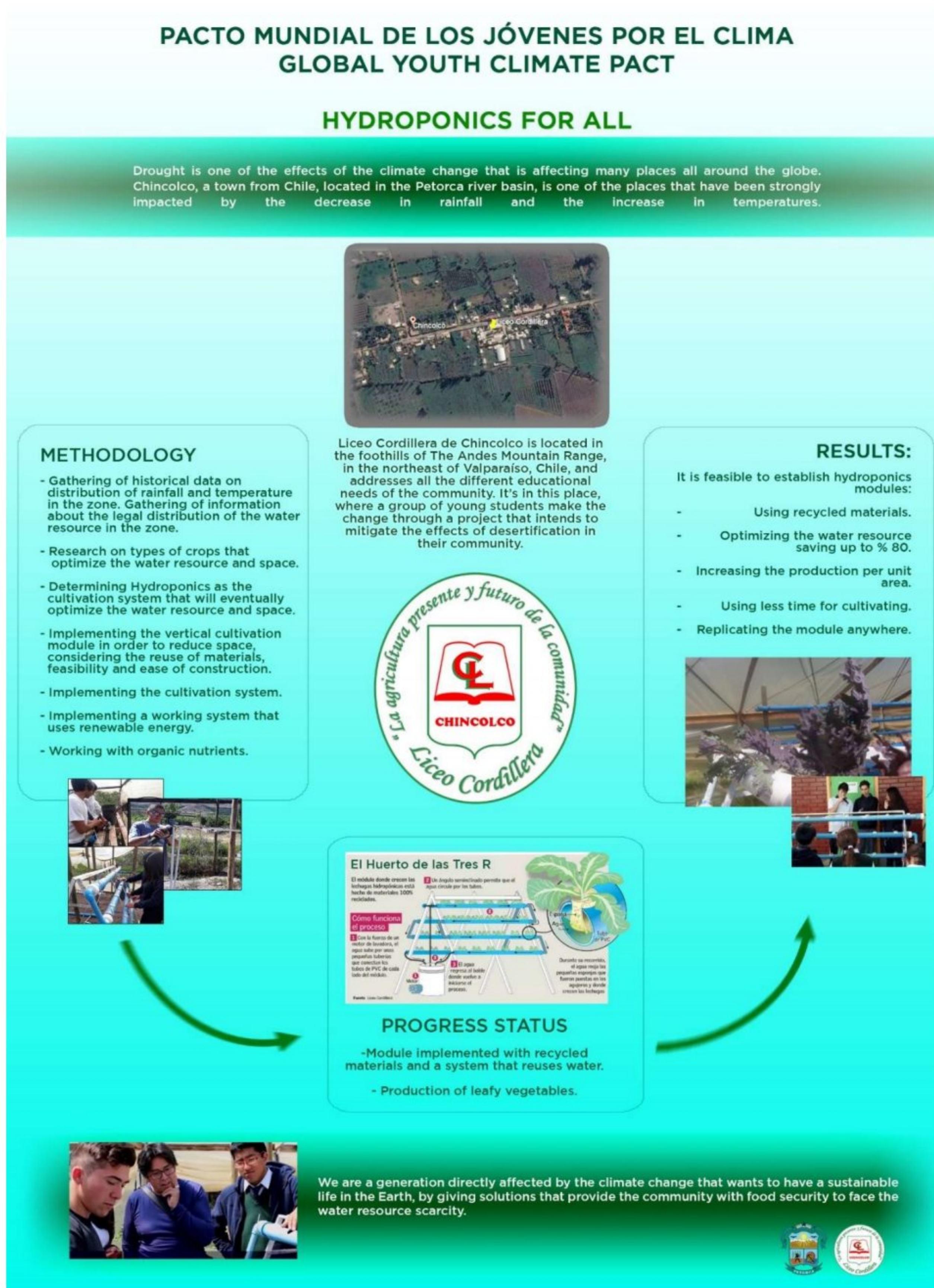
Figure A3. Hydroponics for all.